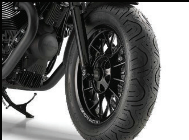
130/90 FRONT TYRE