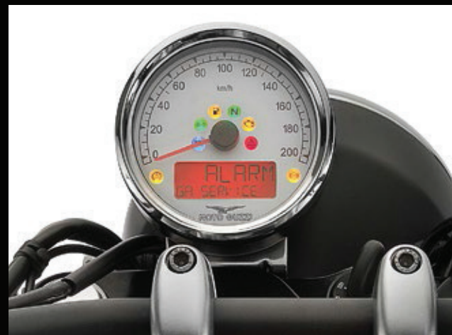
ANALOGUE INSTRUMENTATION WITH LCD DISPLAY