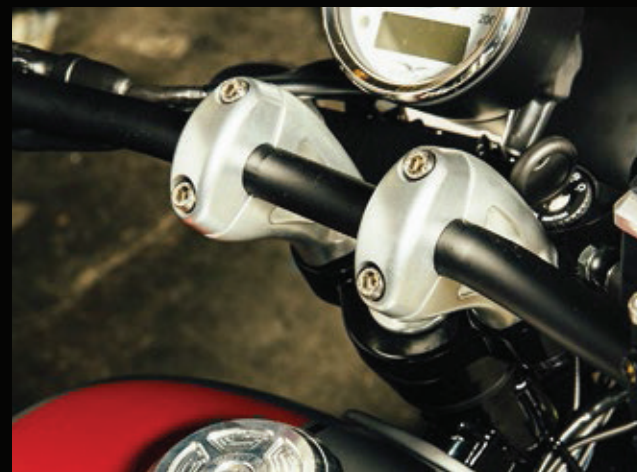
MATT BLACK DRAGBAR HANDLEBAR