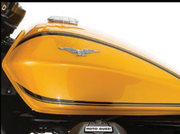
STEEL TANK WITH EMBOSSED EAGLE