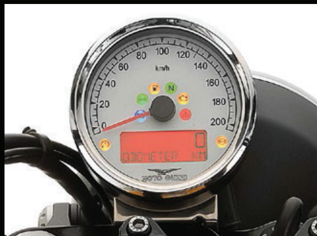
ANALOGUE INSTRUMENTATION WITH LCD DISPLAY