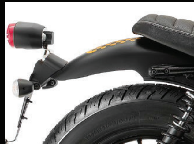
SHORT REAR MUDGUARD