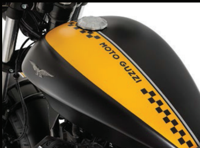
MATT FINISH STEEL TANK