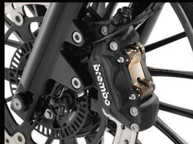
BREMBO 4 PISTON FRONT CALIPER