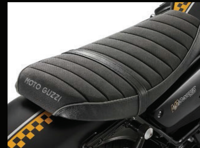
SLEEK SPORTS SADDLE