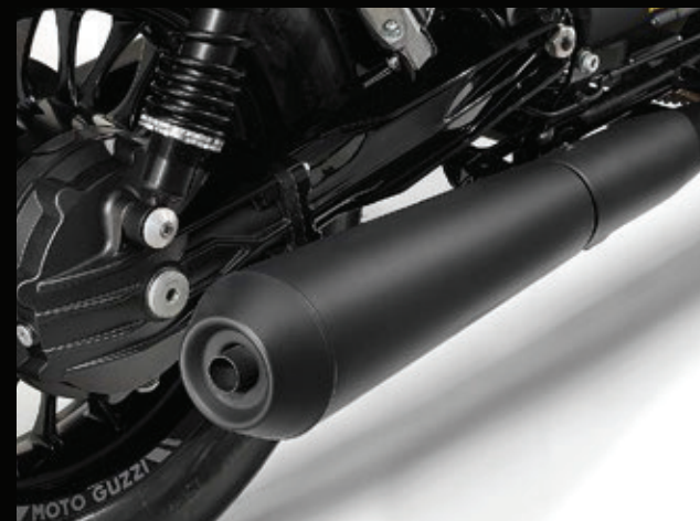
BRUSHED BLACK EXHAUST